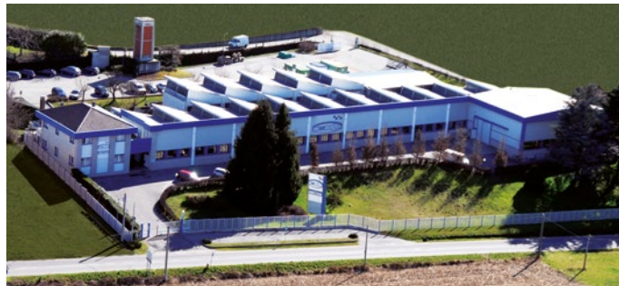
GNR Head Office and Production Site is located in Agrate Conturbia (Novara), near Lago Maggiore; 20 minutes from MALPENSA Airport.

GNR projects and manufactures Optical Emission Spectrometers (OES) and Rotating Disc Electrode Optical Emission Spectrometers (RDE-OES) for the measurement of elemental composition of metal alloys and the analysis of contaminants, additives and wear metals in oils and lubricants, coolants and hydraulic fluids.